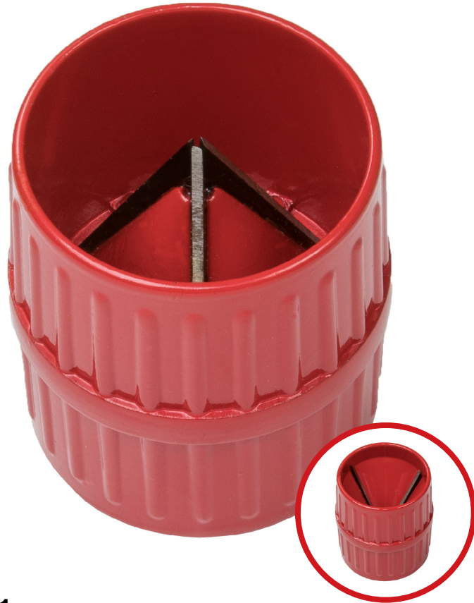
NT2001 PIPE DEBURRING TOOL

Handy reamer used to deburr copper & plastic internally and plastic externally